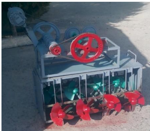
Fig. 1. Micro hydroelectric power station based on a water engine

The engine works as follows. The engine is immersed in water with the front side perpendicular to the water flow and the frame legs are fixed to the bottom. A chain transmission is installed on the rear side of the engine. The working blades will be perpendicular, and the working shafts parallel to the direction of the flow. The generator and power take-off shaft platform located on the frame is above the water. The water flow affects the working blades. Since the blades are located across the plane of the shaft at a certain angle (30 ... 600), they rotate due to the flow of water. Due to the rigid fixation of the blades, the shaft itself rotates. The rotation of the shaft is transmitted to the power take-off shaft by means of chain transmissions.