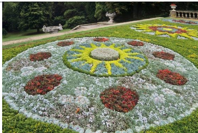
Figure 1. A regular bed

Irregular flower bed. An irregular bed differs from a regular bed in its free design (Fig. 2). It is not difficult to create an irregular flowerbed in the garden area, and it looks natural and light. Planting perennial, simple flower plants in this type of flower bed is the best option. Try to choose the right plants according to their flowering period so that they bloom throughout the summer season, so that your flowerbed will always please everyone. In addition, perennial plants (flowers) do not require you to rearrange the beds every year.