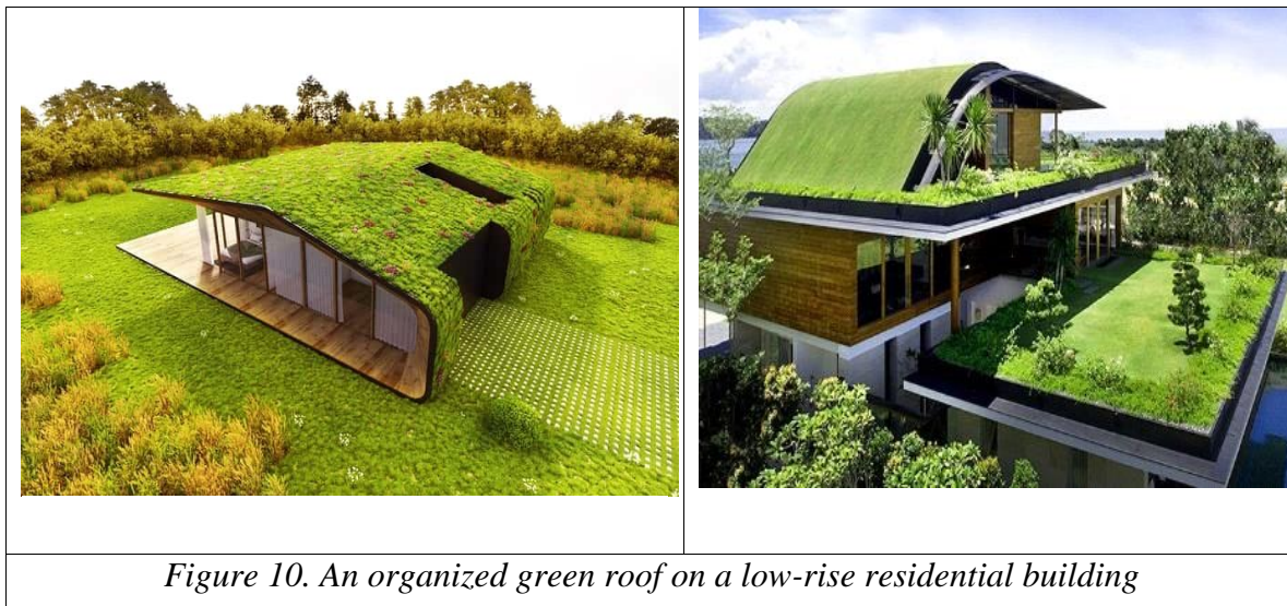
Figure 10. An organized green roof on a low-rise residential building