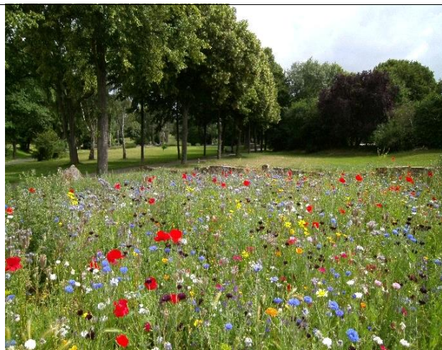
Figure 6. Moorish or flowering lawn

Grassland, or otherwise, grasslands are similar to the Moorish lawn, but simpler than it (Fig. 7). 3-5 different types of perennial plants are planted in large areas of parks. The characteristic aspect of this lawn is its lack of attention.