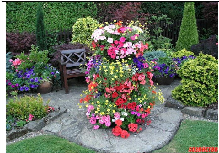
Figure 3. Vertical bed

The lawn. A lawn is a natural or artificial green area covered with grass. According to their creation, lawns are divided into two groups: naturally formed and specially created lawns. It is divided into the following classification types according to the fields of application: ornamental and sports lawns [3].