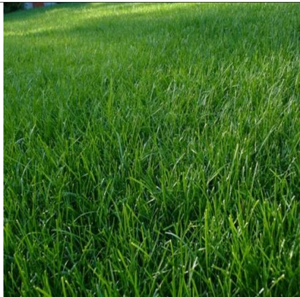
Figure 5. A simple lawn