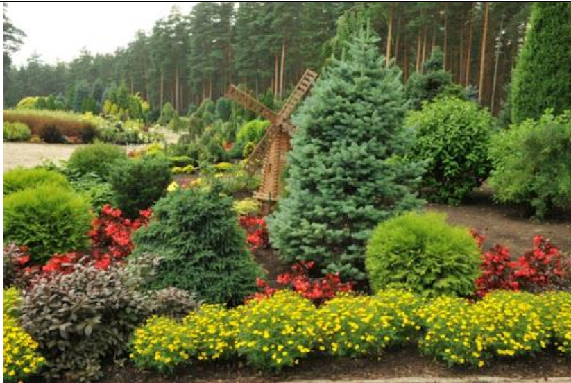
Figure 8. Composition of groups

is recommended to use mixed groups for observation areas (Fig. 8). It is very effective to plant ornamental and coniferous plants in this area, but the biological characteristics of each plant species should be taken into account when designing them [6].