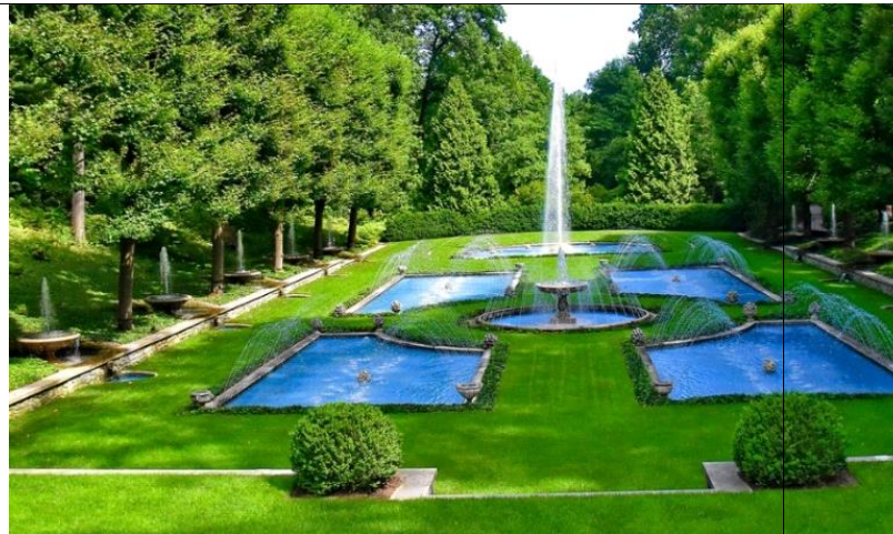
Figure 4. Parterre lawn

An ordinary lawn , this lawn is also known as a park lawn. Its fields of application are squares, gardens and parks. This dense, broad grass cover is distinguished by its perennality, high temperature resistance, and mechanical damage.