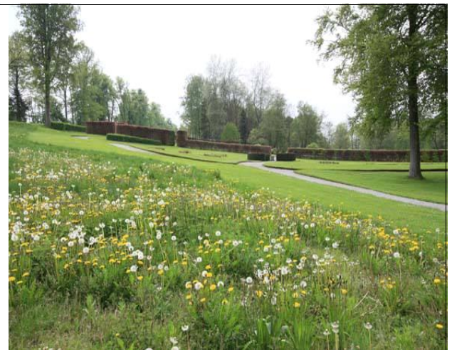
Figure 7. A meadow, or else a lexical lawn

Sports lawn. This grass cover is grown with a specific purpose, i.e. to play football and golf, which are sports. Such lawns are resistant to heavy loads and bad weather.