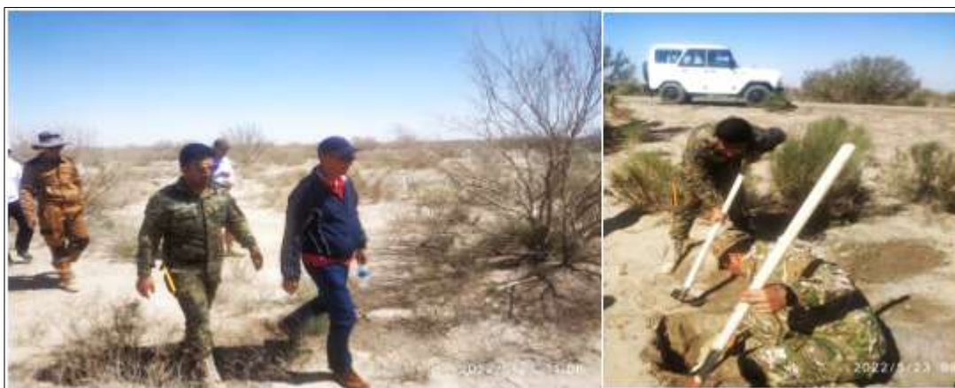
2-picture. In the part of the sea-drained geoecological works 2022 y.

national project for the purpose of important tasks that have been identified. In this regard, in particular, the environmental situation through the power of focused research position zoned to optimize the environmental geoecological sea region plays an important role. The president of the republic of uzbekistan "planting work in the republic of speeding up, the organization more effective measures on the protection of the trees" in the year 2021 December 30, pf-46-number and decree "on measures for further improvement of the management system work, household and construction waste associated with the year 2020" on September 29 PP-4845-ensure the implementation of the resolution, the environment and the protection of material cultural heritage objects and their use in the field of further improvement of state control, as well as modern information and communication technologies in order to introduce this process in the coming years, the natural environment surrounding the monitoring program in the republic of uzbekistan"on the activity of the decree and other normative legal acts on the implementation of the tasks specified in this scientific research work serves at a certain level.