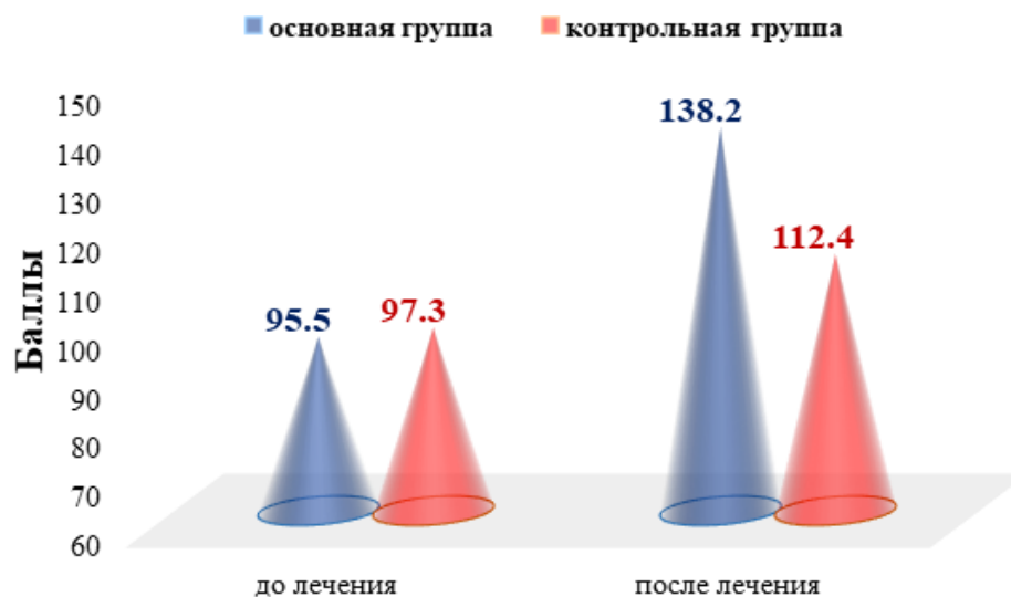
Figure 3. Results of assessing the quality of life of patients over time.

Along with an increase in hemoglobin levels in patients in the study groups, there was also an improvement in the quality of life indicator, the values of which according to the FACT-An test were 95.5 and 97.3 points in the main and control groups, respectively. After treatment, the average score of patients in the main group increased to 138.2 points, while in the control group it increased to 112.4 points (Fig. 3).