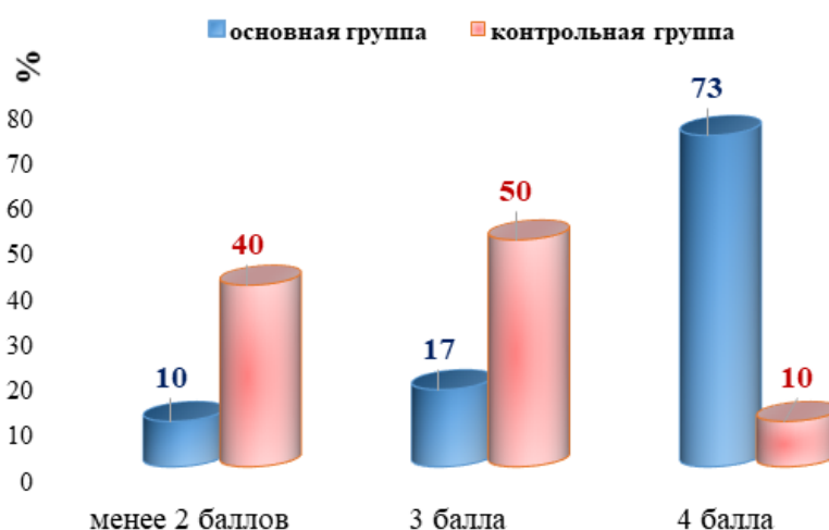
Figure 1. Results of adherence assessment using the Morisky-Green scale in patients after 3 months of therapy.

The number of adherents to therapy was 73% in the main group, while in the control group it was only 10%. Observations of the dynamics of hemoglobin growth in the study groups showed that in the main group there was a higher level of its monthly increase in the blood (Fig. 2). By the end of 3 months, in the main group the hemoglobin level averaged 121 g/l, while in the control group it was 111 g/l.