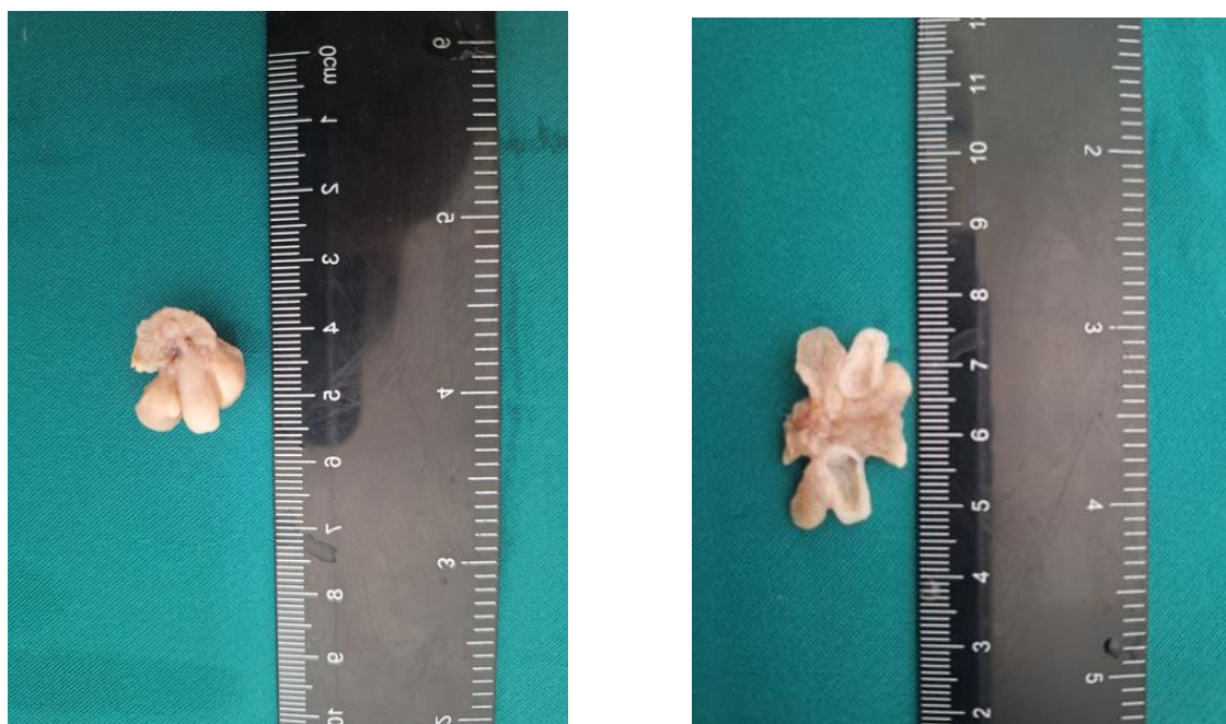
Figure 1 Gross view of rat male urogenital organs. Anterior and posterior views of the prostate gland of a 6-month-old white outbred male rat.

Normal ampullary glands in the rat surround the vas deferens. The alveoli are large, uniform in size, and surrounded by a few smooth muscle cells and connective tissue stroma. Strong eosinophilic secretions are often observed in the alveoli. The epithelium is flattened into cuboidal secretory cells with centrally located nuclei and some basal cells (Cleary, Choi, and Ayala 1983; Brawick and Mardi 1983; Hayward et al. 1996).