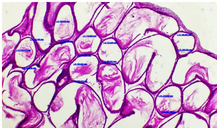
Fig. 1. Testicles of 76-day-old rats. 1-convoluted bundles of spermatozoites; 2-channel space. Hematoxylin-eosin staining. Ob. 10 x ok. 20

The mass of the epididymis varies individually from 0.6 g to 0.85 g, on average - 0.76 \pm 0.025 g. The growth rate is 36.4%, and the absolute increase is 0.2 g. The length of the epididymis is 1.2 - 1.6 cm, on average - 1.30 \pm 0.04 cm. Growth rate - 32.7%, absolute growth - 0.32 cm. The thickness of the epididymis ranges from 0.7 to 1.5 cm, on average - 0.9 \pm 0.08 cm. The growth rate is 38.5%, the absolute growth is 0.25 cm. The volume of the epididymis individually ranges from 0.6 to 0.8 cm 3 , on average - 0.64 \pm 0.02 cm 3 . The volume of the epididymis increased by 2.2 times compared to the previous age, the growth rate was 117.7%. The absolute increase was 0.346 cm 3 . The tissue density of the epididymis at this age decreases to 1.18 g/cm 3 . As microscopic examination of sections of tissue of the epididymis shows, at this age the diameter of the convoluted seminiferous tubules increases, a free lumen appears for the advancement of mature sperm, therefore the density of the tissue of the epididymis sharply decreases.