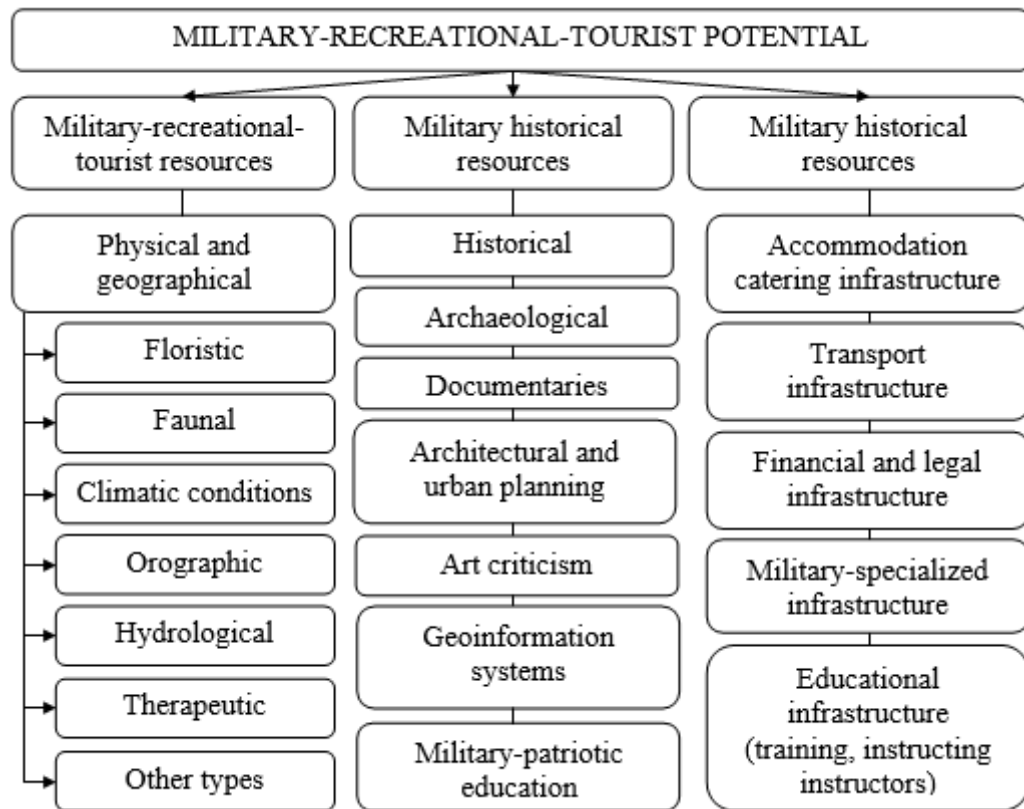
Figure 2. The structural basis of the classification of the military-recreational-tourist potential of the country

It is established that the "recreational potential" is based on two basic resources – recreational resources and socio-economic resources. The author's analysis of foreign literature (including CIS countries), as well as domestic studies, is also interesting, which showed that the issues of classification of the military-recreational and military-tourist potential of the region are indeed poorly studied (the leading journals included in authoritative databases have been studied). In this regard, there is a need to develop a classification of the military-recreational and military-tourist potential of the region. At the same time, based on the purpose of the study, it was decided to develop a unified classification of the military, recreational and tourist potential of the region (Fig.2).