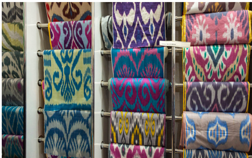
Figure 1. Ikat fabrics.

The cultural significance and artistic value of ikat fabrics (see figure 1) transcend their function as textiles. Traditionally, they have been symbols of identity, craftsmanship, and ritualistic importance. The method of interlacements, wherein the warp and weft yarns are interwoven following specific techniques, is crucial in creating ikat's characteristic blurred patterns. This interplay underscores the fusion of manual dexterity and artistic creativity [1-4].