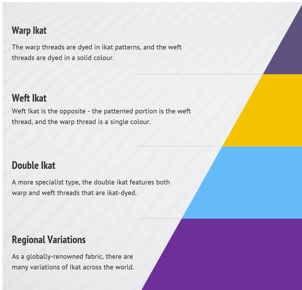
Figure 3. Types of ikat fabrics [10].

Environmental Considerations. Traditional dyeing techniques often use natural dyes, contributing to sustainable practices. However, the shift towards industrial production poses environmental challenges. Researchers advocate for eco-friendly dyes and practices to maintain sustainability in ikat production [11].