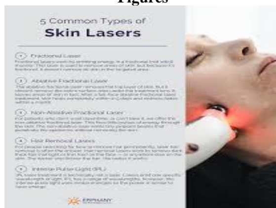
Figure 1: Types of Lasers Used in Dermatology