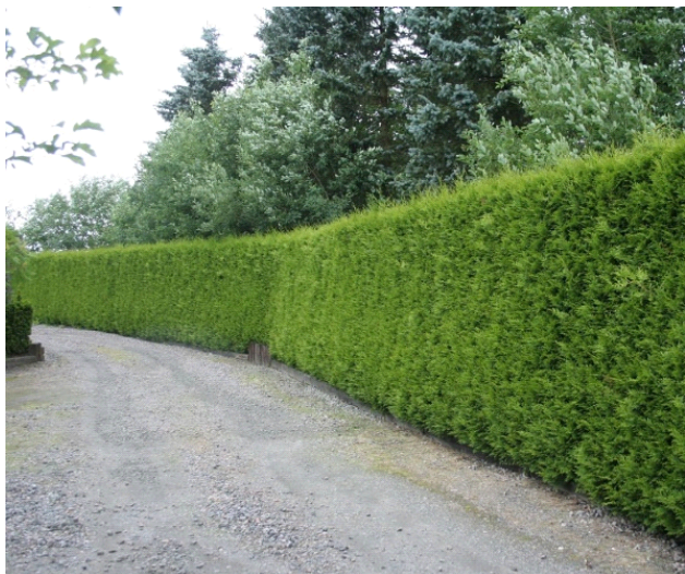
Figure 1. A green fence made of camellia